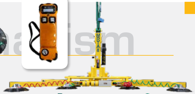
4 pad configuration Capacity: 320kg