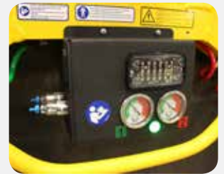
Featuring a new dual circuit vacuum system.