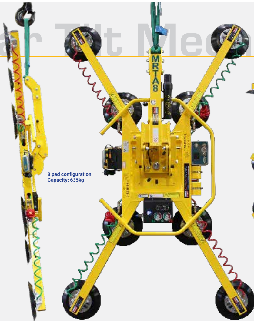
8 pad configuration Capacity: 635kg