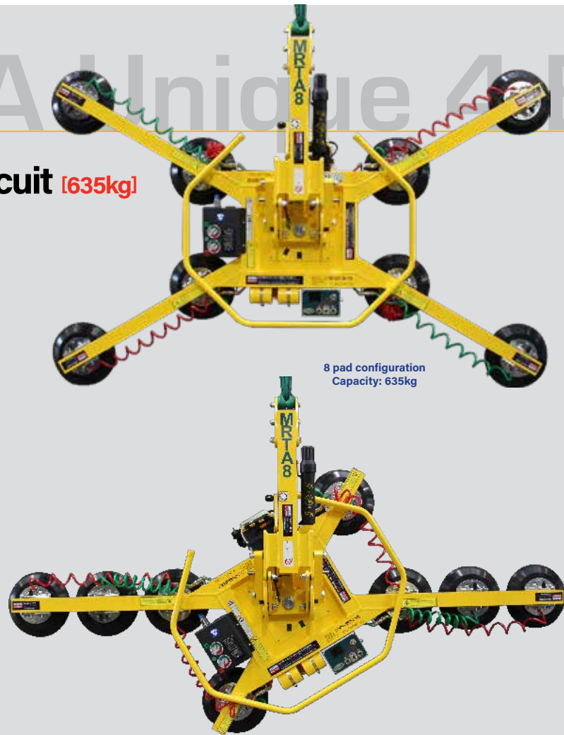
8 pad configuration Capacity: 635kg