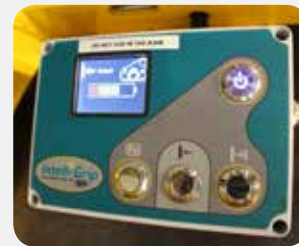
The Intelli-Grip technology monitors vacuum lifters in real-time.