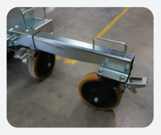
Features include stabilisers to help ensure safe lifting is carried out.