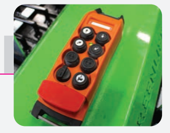
Lifting operations are easily carried out with the included radio remote control.